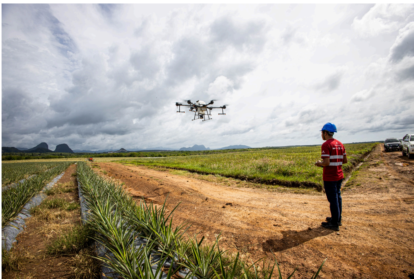
FGVTOP, a web-based platform providing authorised users

FGV's commitment to transparency and responsible business practices is further reinforced by its recent clearance by the United States (U.S.) Customs and Border Protection (CBP) to export palm oil and palm oil products to the U.S. following the modification of the Withhold Release Order (WRO), effective 15 January 2026. The decision reflects the importance of sustained improvements in labour practices and supply chain governance in meeting evolving regulatory expectations. In this context, FGV Traceability of Product (FGVTOP) supports FGV's sustainability approach by providing a digital platform that strengthens transparency, accountability and compliance across its palm oil supply chain.